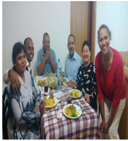
Curry and rice and fellowship