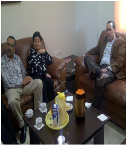
Fellowship time over coffee after ministry