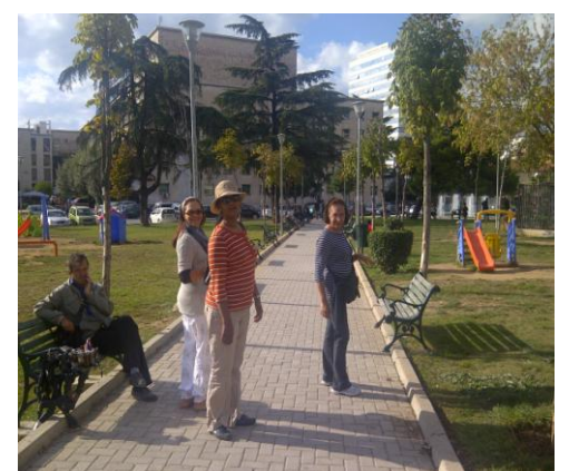
Just as they are